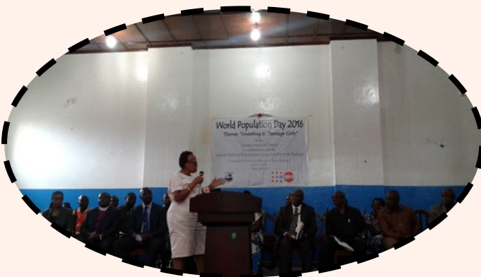
Minister Julia Duncan Cassell

The Minister of Gender, Children and Social Protection, Mrs. Julia Duncan-Cassel said investment